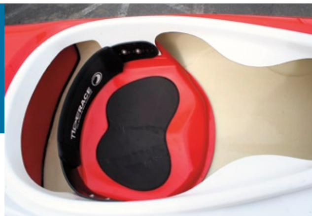
The accommodations are simple but comfortable and secure.

The Xcape has “very good stowage for weeklong or longer trips. Four KajakSport hatches, including the deck hatch, and the large oval bow and stern openings make packing a breeze and make toting long, slender items or large, roundish items